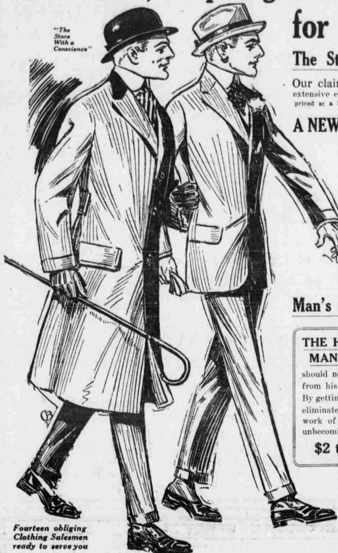
Fourteen obliging Clothing Salesmen ready to serve you

Man's Every Apparel Want is Best Satisfied from Our Great Stocks