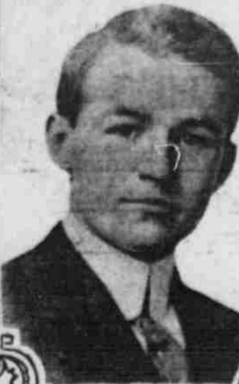
Oldham Paisley Editor-in-Chief