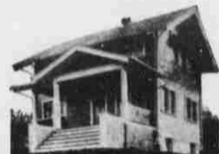
7 Rooms $797