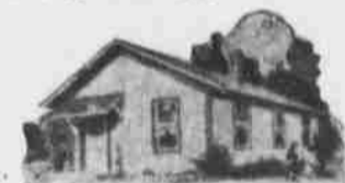
5 Rooms $298

The Aladdin system of selling direct from the forest to the home builder saves all the usual middlemen's profits. The Aladdin System of construction—Readi-Cut—(same as steel building construction) cuts half the usual labor bill. Every piece of material cut to fit in our mills, marked and numbered and ready for erection.