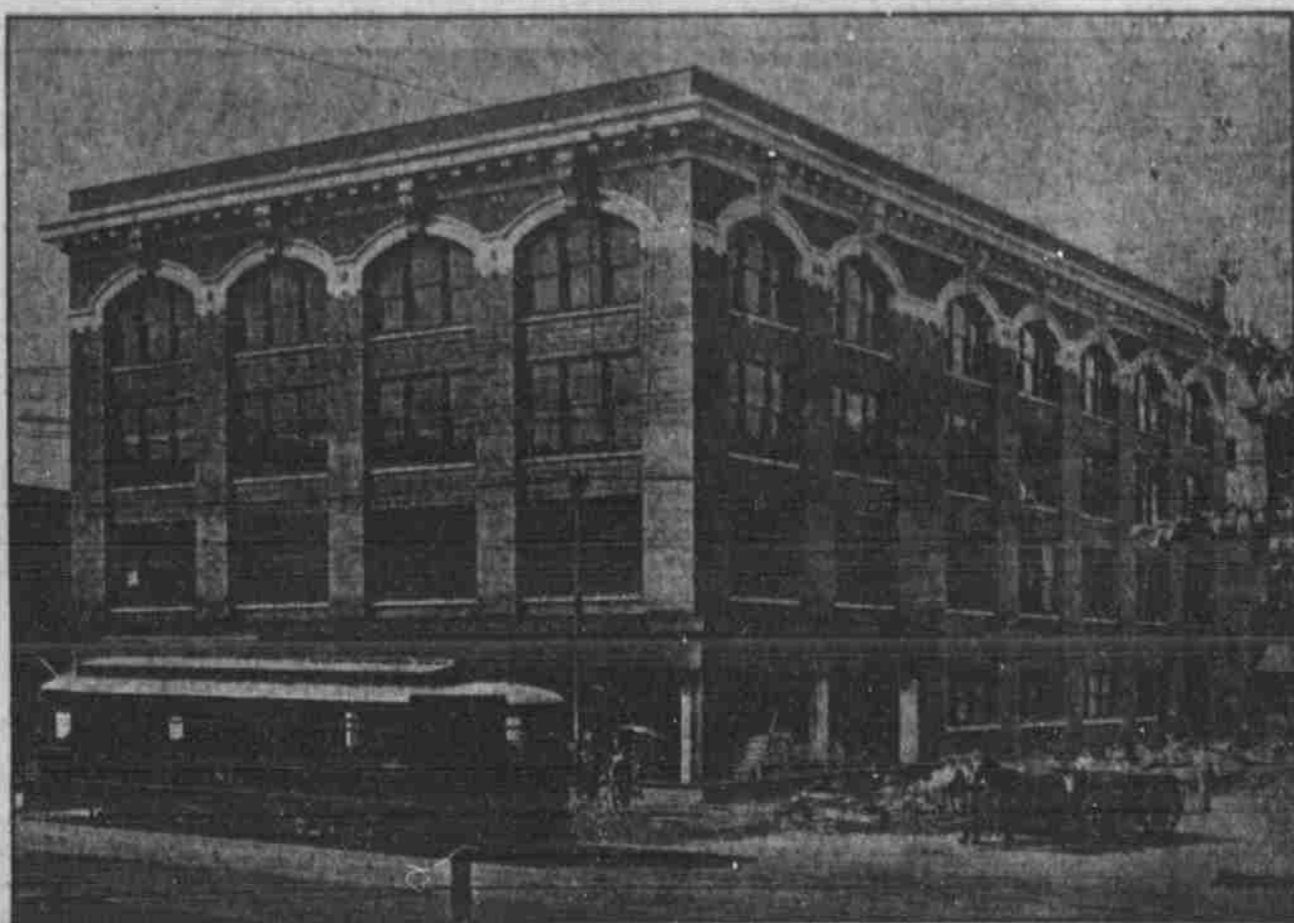
NEW STUDEBAKER BUILDING ON WEST FARNAM STREET.

The new building of the Studebaker Corporation of America at Twenty-fifth avenue and Farnam street, Omaha, which was designed by John Latenser, architect, will be used exclusively for Studebaker automobiles. The company will begin moving into the new building immediately after the Ak-Sar-Ben carnival. The Studebaker building is by far the largest and finest of its kind in the middle west. It is built of pressed brick of a reddish color, trimmed lavishly with cream terra cotta. There will be 115 feet of large plate glass show windows. The sample floor will measure 79x73 feet. The floor is of terrazzo, the woodwork mahogany and the walls finished in old rose. Besides the show room on the first floor will be the manager's private office and general offices, three toilet