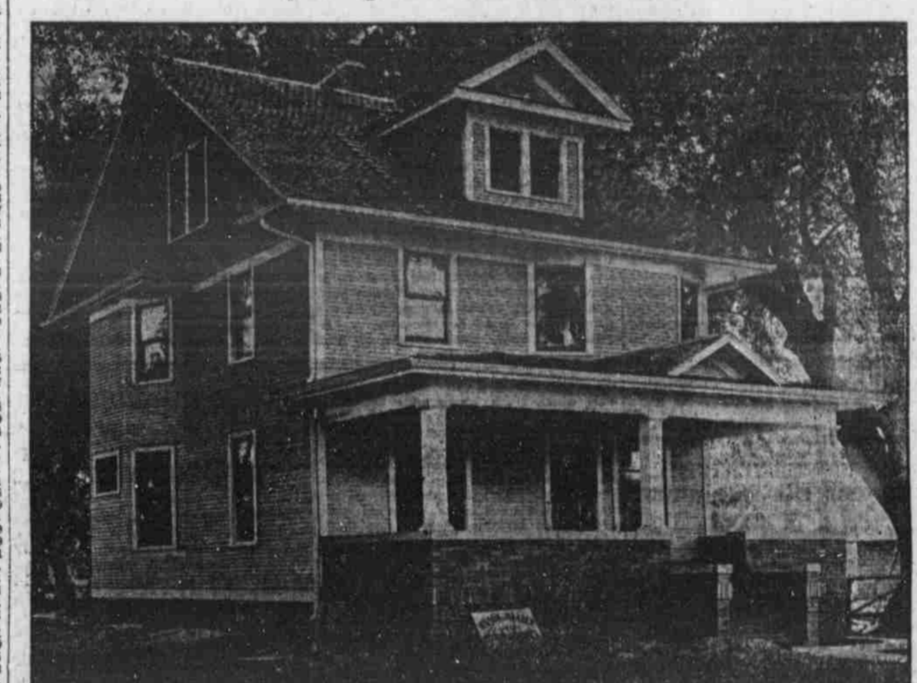
A combination of stucco trimming and full press brick porch is seen in the above house, just completed by Wilson and Warren at 2419 Evans street. The design is new and includes Flaxlinum in outside walls as non-conductor of heat and cold.