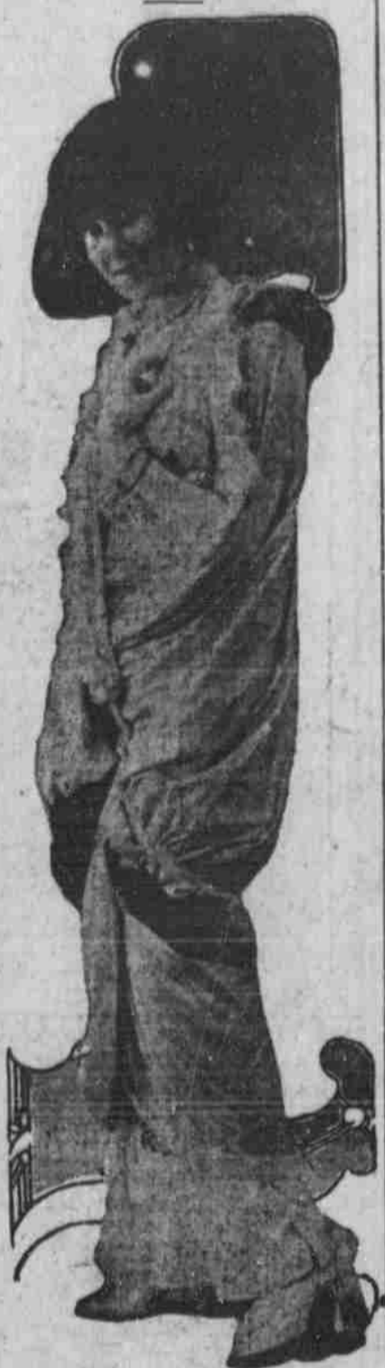
By LA RACONTEUSE.

MEMBERS of the Board of Governors are having strenuous times, attending state fairs and carnivals and deciding upon entertainments for Ak-Sar-Ben.