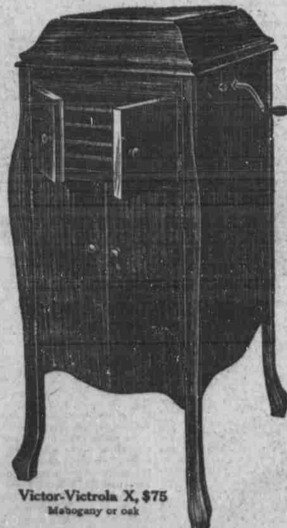
Victor-Victrola X, $75 Mahogany or oak

Victor Talking Machine Co. Camden, N. J.