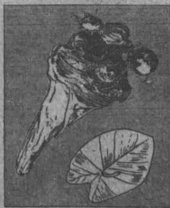
Tuber and Leaf of the Asiatic "Dasheen" Which May Prove a Valuable Substitute for the Potato.

It is well known that the failure of one potato crop in Ireland reduces thousands of the population to starvation's point. In this country a scarcity of potatoes, with prices increased three or four times above normal, adds a heavy burden to those borne by a majority of households, as few families now economize in the matter of potatoes any more than they do in the case of bread.