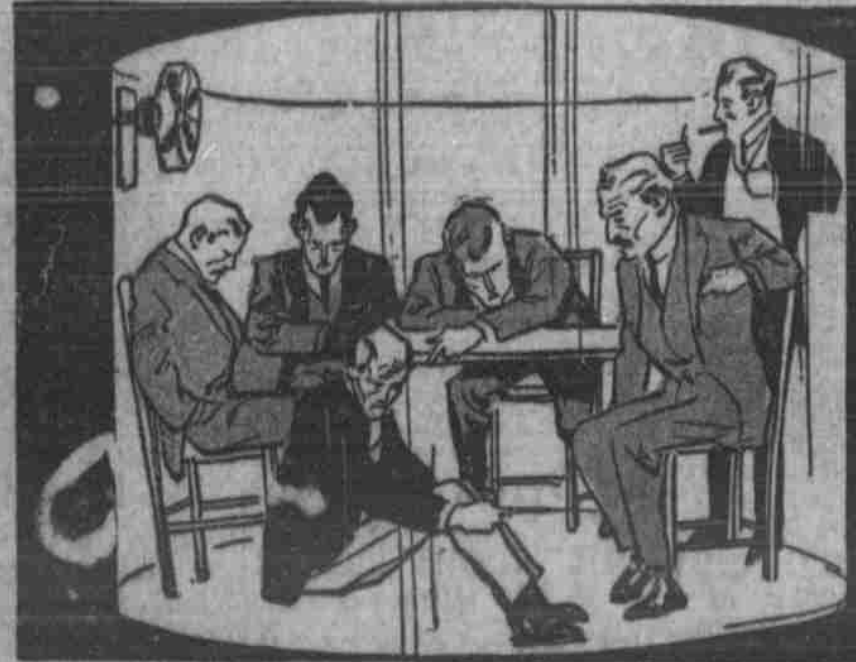
"After remaining for some time in the air-tight room the men began to suffer. Sweat poured out upon their bodies and one of them cried out that he was choking. The oxygen was reduced and the carbonic acid gas increased to such an extent that they could not light matches and their cigarettes went out."

It is the circulation of air you get in the country, the beating of the sun and the rain in your face that do you good, not the superior quality of the country air, because it isn't superior in any great degree.