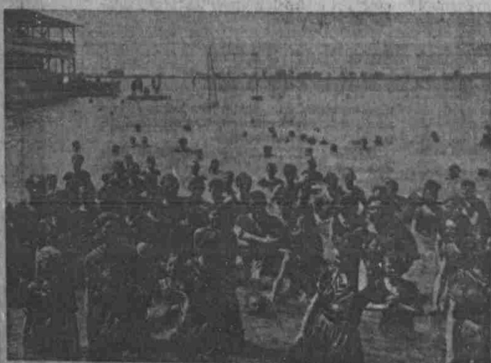
HUNDREDS ENJOY THE BATHING EACH DAY

Every Afternoon and Evening Until July 5. Reserved Seat at Each Concert, 10c