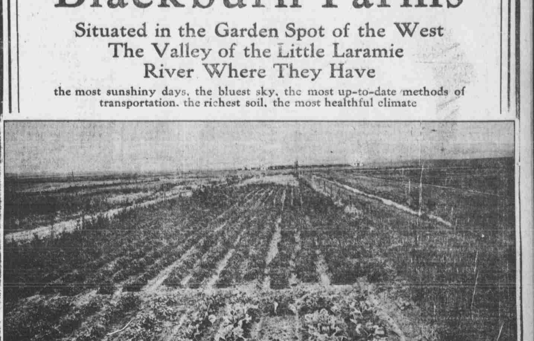
BLACKBURN FARMS GARDEN, SHOWING LAY OF THE LAND.

The air is so pure that it is a deadly poison for all microbes with an affinity for animal life; no "white plague" or other diseases of the respiratory organs can exist; hog cholera is unknown.