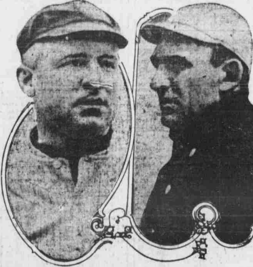
Left to right: John J. McGraw and Fred Clarke, Pittsburgh Pirates for first honors in the 1913 race.