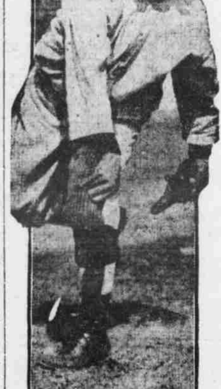
Big Jeff Tesreau, the marmoth twirler of the New York pitching squad, is spoken of as Manager McGraw's choice to pitch the opening game against George Stallings' rejuvenated Boston team at the Polo grounds.