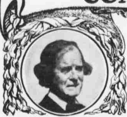
Mr. Elbert Hubbard