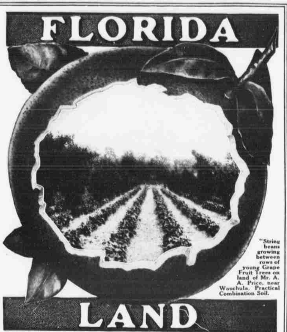
"String beans growing between rows of young Grape Fruit Trees on land of Mr. A. A. Price, near Wauchula. Practical Combination Soil."

Florida Land guaranteed by a home company of bankers. The proved Wauchula Combination Soil, where vegetables yield a comfortable living until grape fruit and oranges bring fortune. This land in the very heart of the remarkable Peace River Valley is the one large section where vegetables can be grown on a big scale between the rows of young orange and grape fruit trees. And it's being done. Men whose records stand the closest scrutiny give this land their unqualified endorsement. Read below about the guarantee and the year's time for inspection.