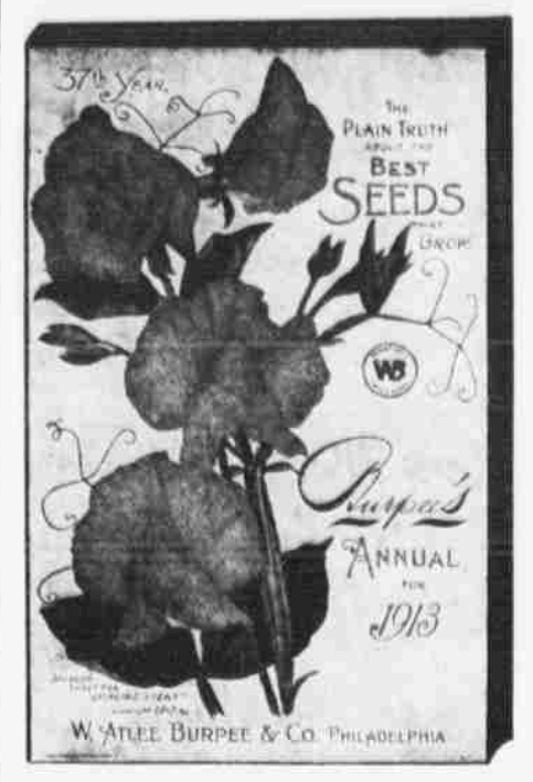
Reduced Facsimile Front Cover of