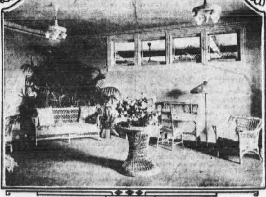
Ladies Reception Room

Favors Appointive Board. There is a sentiment in the committee favoring legislation that will make the state board of agriculture an appointive board instead of one elected by delegates from the various county fair boards of the state. Members of the committee maintain that this present system of choosing the state board of agriculture is a system of self perpetuation in office. The proposition that will be brought before the legislative committee of the federation will provide for the appoint-