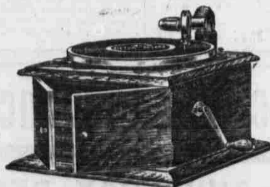
Victor-Victrola IV, $15 Oak

Victor Talking Machine Co., Camden, N. J.