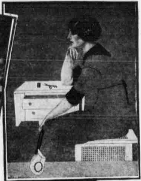
"Her Idle While" —by C. Coles Phillips.