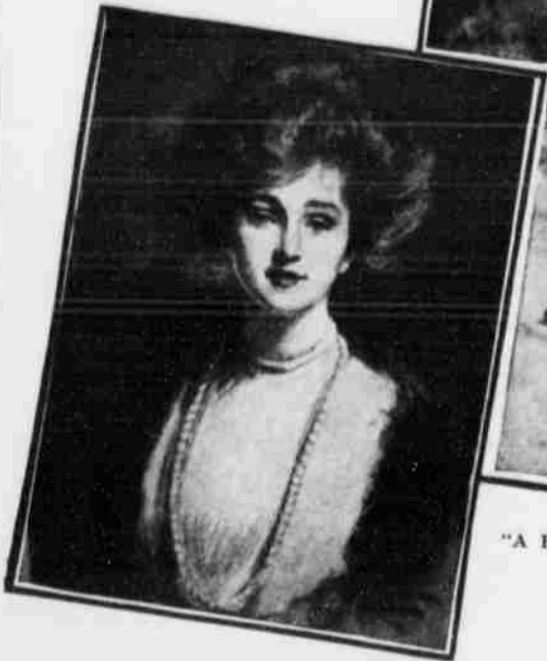
"The Girl of 1912" —by Charles Dana Gibson.