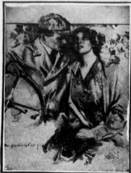
"Why He Missed the Aeroplane" —by Howard Chandler Christy.