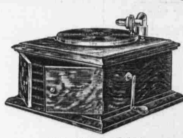
Victor-Victrola VI, $25

Victor Department Third Floor Cor. 16th and Harney Sts.