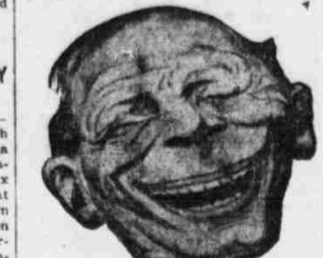
Kellogg's Sanitone Wafers Make You Feel Fine All the Time.

This is the world's newest, safest, most reliable and effective nerve invigorator, revitalizer, brain awakener, body strengthener, without equal in the world's history of medicine. It brings about a change from that awful, dull, weak, lazy, don't-give-a-hang feeling to brightness, strength, clear-headedness and courage which is remarkable.