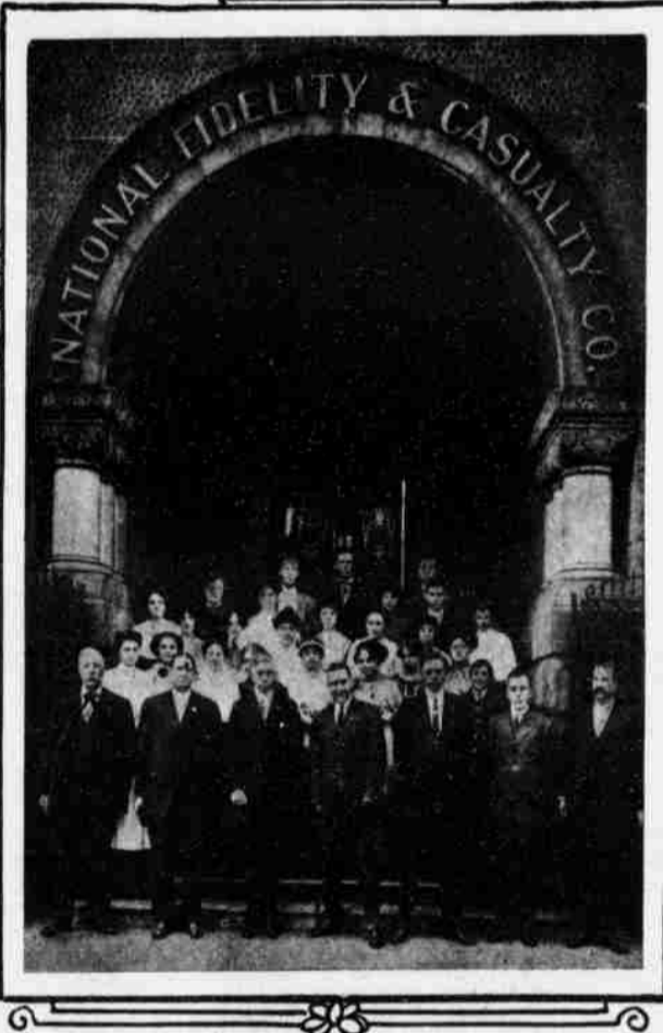
Home Office Employees - National Fidelity and Casualty Company.

While the National Fidelity and Casualty Company has met with the keenest competition from its eastern competitors, it is now writing the largest business of any com-