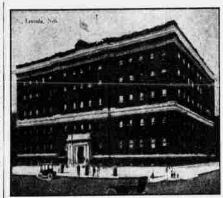
Lincoln Y. M. C. A. Building