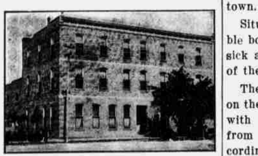
Chadron Y. M. C. A. Building

non-association points. State memberships are offered him which give him visiting privileges of associations for a nominal fee. Letters of introduction are sent him to asso-