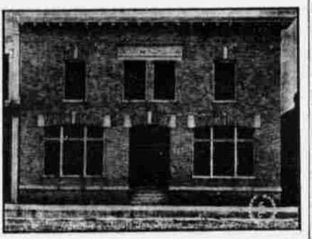
Central City Y. M. C. A. Building