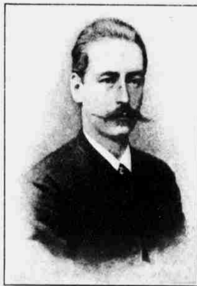
Wilhelm Voigt "The Colonel of Koepenick"