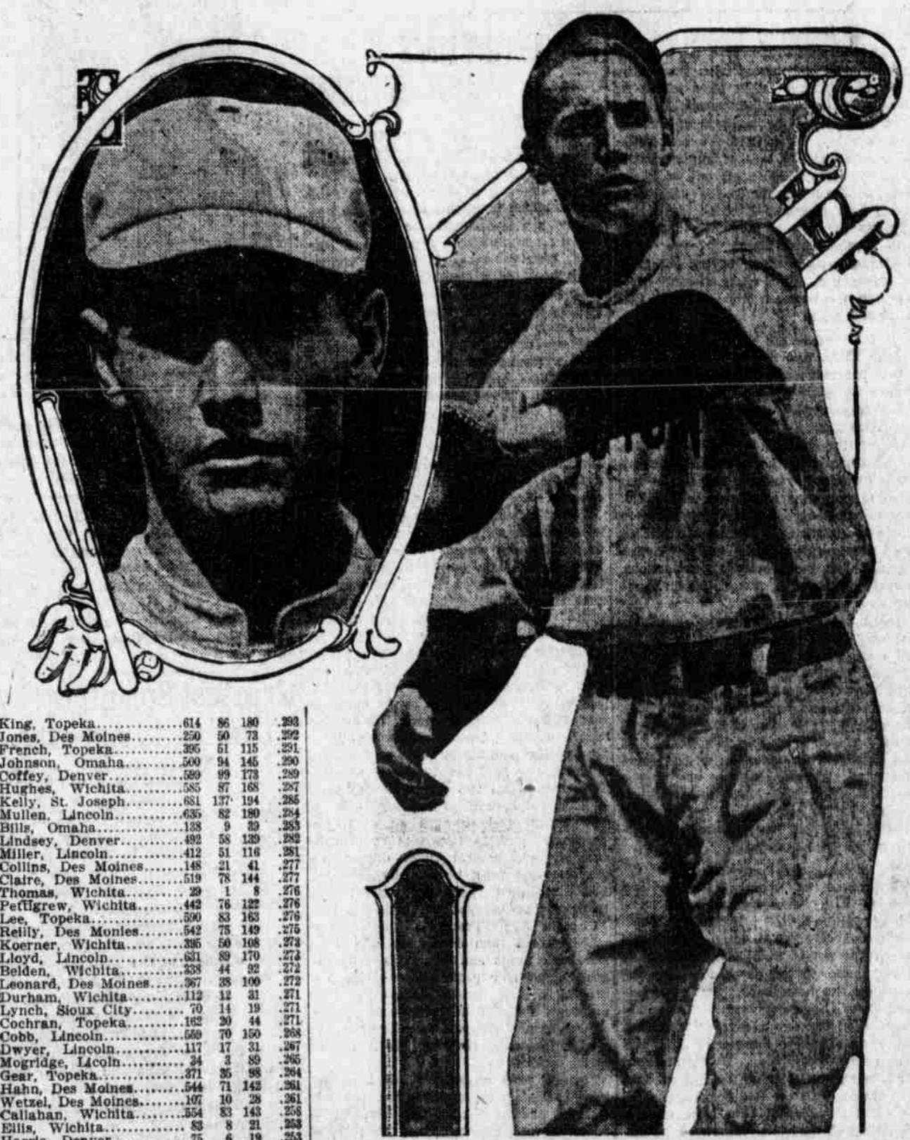
Joe Wood, "Smoky Joe," so-called because of the alleged smudge raked when the ball is thrown go burning through the air, is expected to prove the Giants' toughest opponent in the coming world's series.

The big world's series between the New York Giants and Boston Red Sox begins Tuesday, and if anybody has an inside line on the outcome we would be glad to have it.