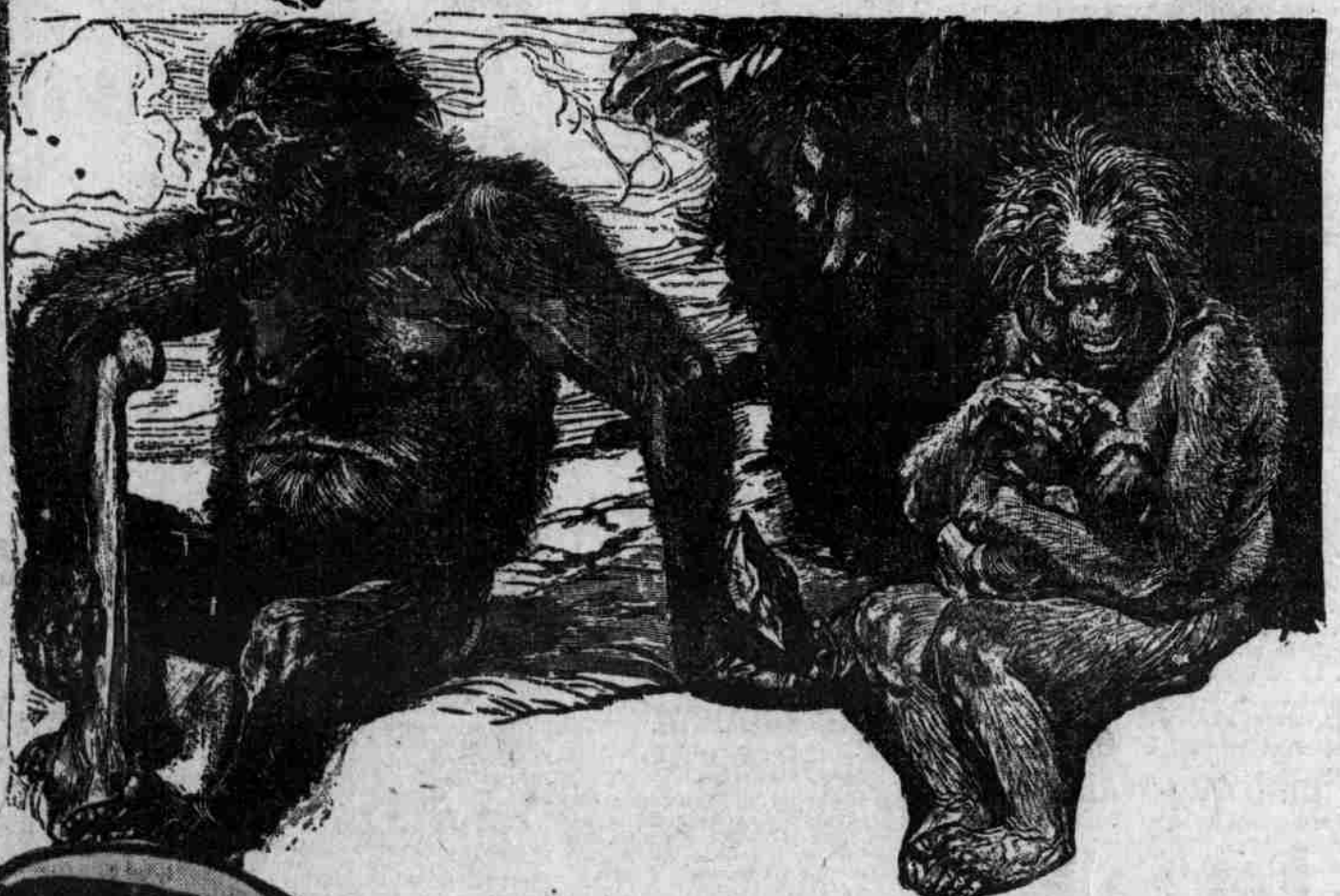
The Ancestors of Man Just Before We Assumed the Distinctly Human Shape, Drawn by Heppenheimer, of Munich.

tiply out of all proper proportion. The face of the average Englishman will be that of a typical criminal with prognathous jaws, receding forehead, broad, flat nose, well marked canine teeth, small eyes, short neck, head set well back between the shoulders and a depraved gorilla countenance. The nation is being propagated mainly by those who retain their primordial qualities and primitive instincts. Therefore, we must go back to the gorilla type of humanity. The better class of