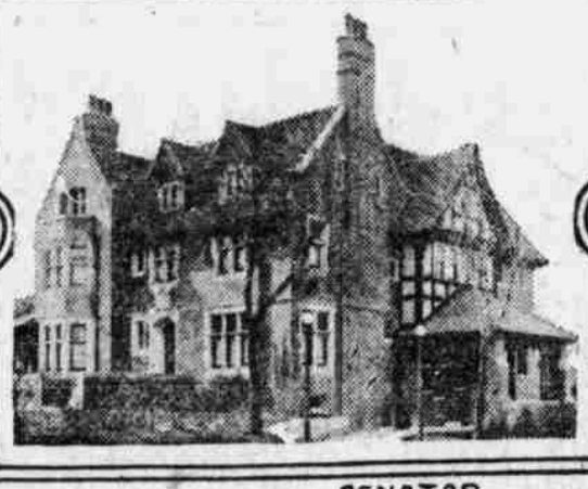
SENATOR J.H. MILLARD 500 S. 38 ST.