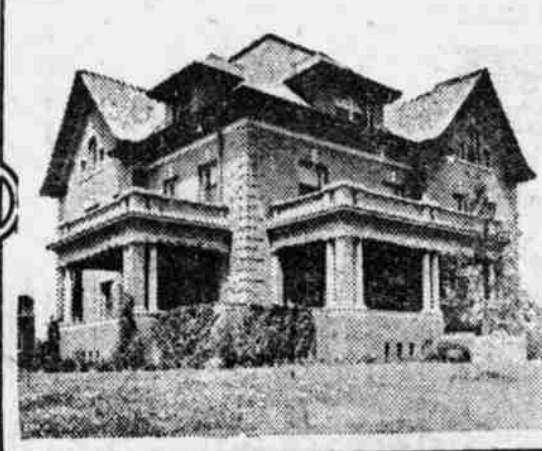
JOHN DOUGHERTY FOUR THREE TWO SOUTH THIRTYNINTH STREET