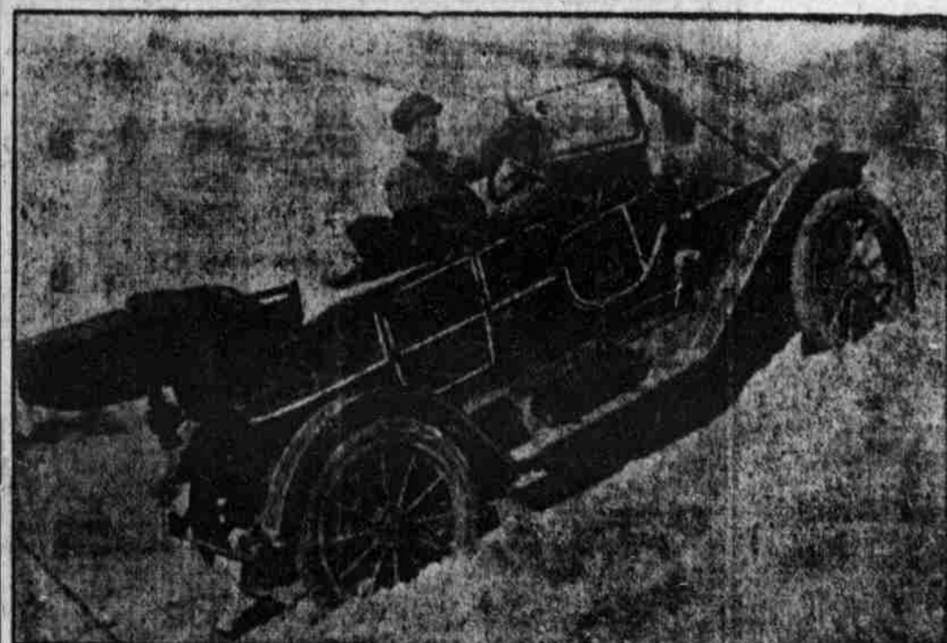
They never hesitate. Their minimum speed and maximum power enable them to travel where geared cars are never seen.