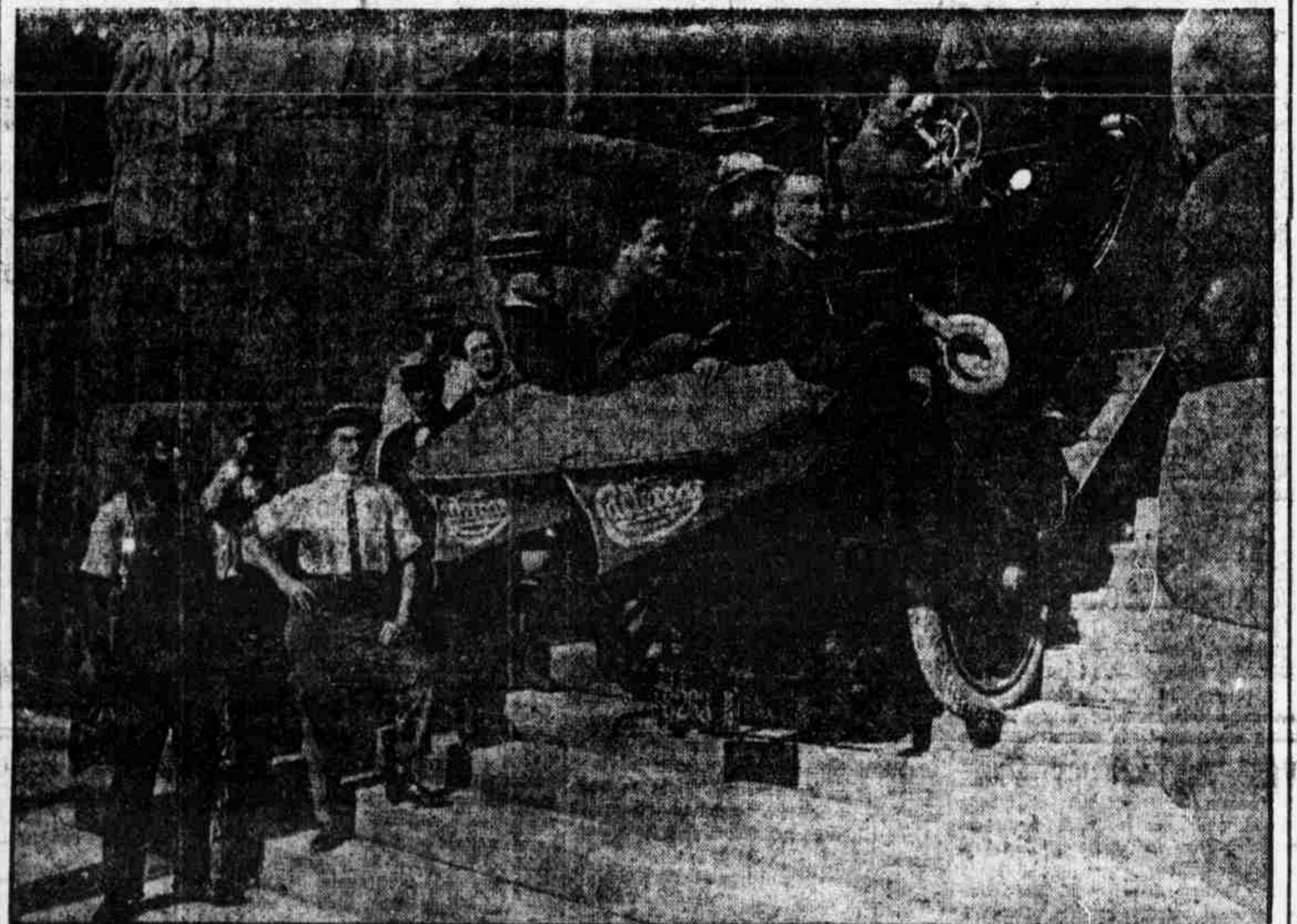
Cartercar with six passengers climbing the Omaha City Hall steps August 27. This demonstration attracted hundreds of people and is a most convincing argument as to the pulling power of the Cartercar Friction Transmission.