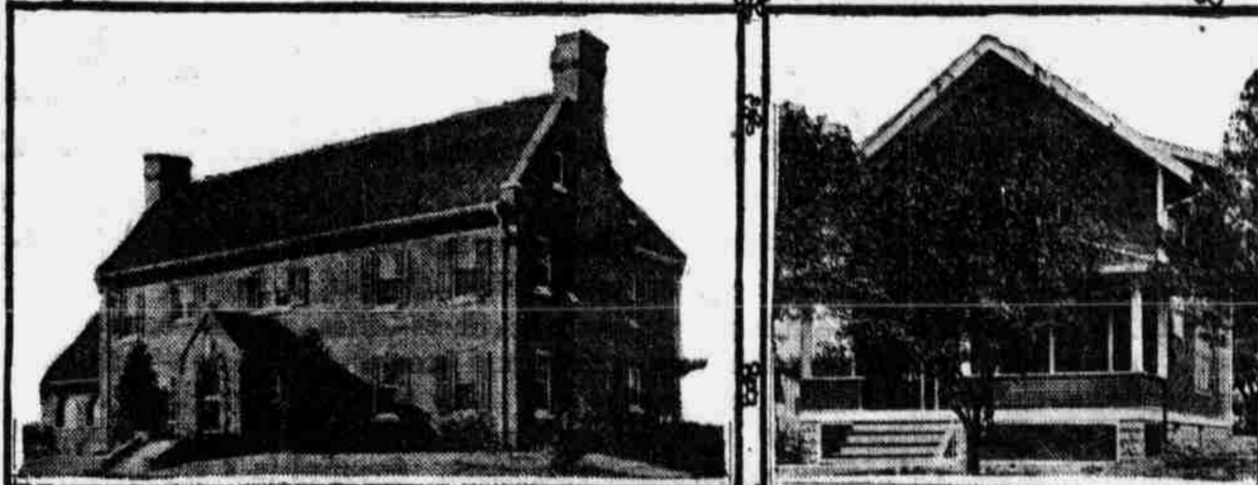
Home of Lyman O. Pearly—Fairacres Home Builders' Bungalow—Dundas

Homes of today must be cool in summer and warm in winter. The prospective builder demands these conditions. Brick as a construction material is one of the most satisfactory. It produces a sound building that offers all comforts demanded in summer and all needed for warmth in winter when wind and snow test buildings. It is coming into use by a greater number of builders every year. Some home owners declare that brick houses are the most beautiful as well as the most substantial.