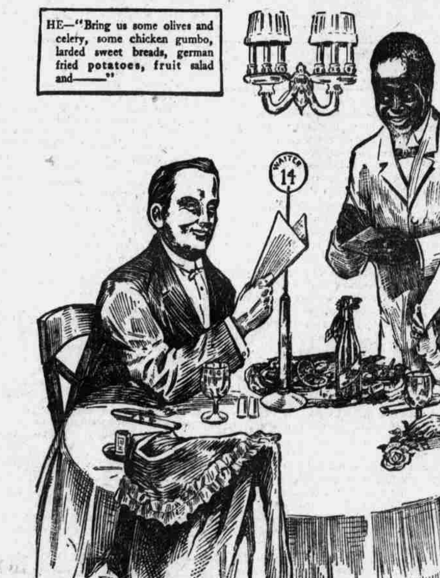
HE—"Bring us some olives and celery, some chicken gumbo, larded sweet breads, german fried potatoes, fruit salad and..." SHE—"And please order another bottle of this delicious 'Blue Ribbon' Beer—it's the only beer that I ever really enjoy."

WASHINGTON, Sept. 9.—Normal temperatures for the season is predicted by the weather bureau for the coming week in the lake region, the great central valley, the plains states and the Rocky mountain and plateau regions. Though the weather will be generally fair, fairly well distributed showers are probable in the northern and eastern states.