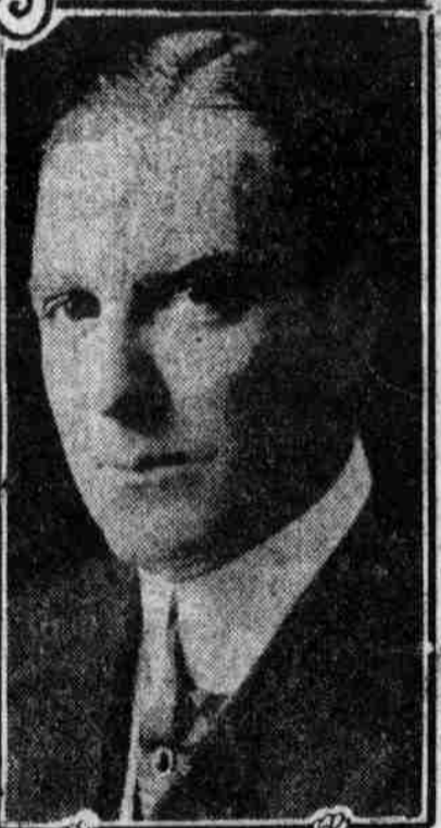
HOLBROOK BLINN in "Romance of the Underworld" At the Boyd