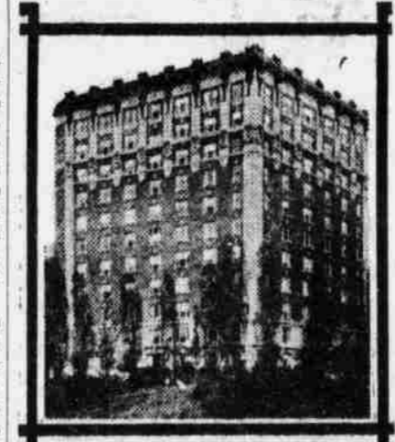
BEAUTY IS ATTAINED BY USE OF HANDSOME BRICK.

This beautiful building was constructed of hydraulic press brick, the kind sold by the Hydraulic Press Brick company, 230 Bee building, Omaha. This apartment is located on Riverside Drive, at the north corner of Ninety-third street, New York City. The beauty of the structure attracts the attention of thousands who pass along the famous drive.