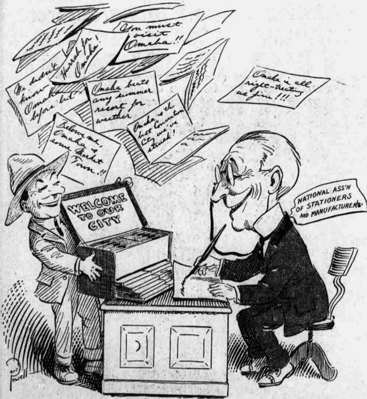
Plenty more where these came from.