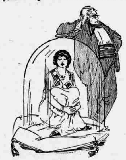
"One heart, one mind, one Soul-and that one his."

There is a shadowy unattested story that out of a foundling asylum came a child who became the Governor of his adopted State. Even granted that this hazy story be true, a Governorship is not the most exalted office, and if I read my politics aright the office has often been