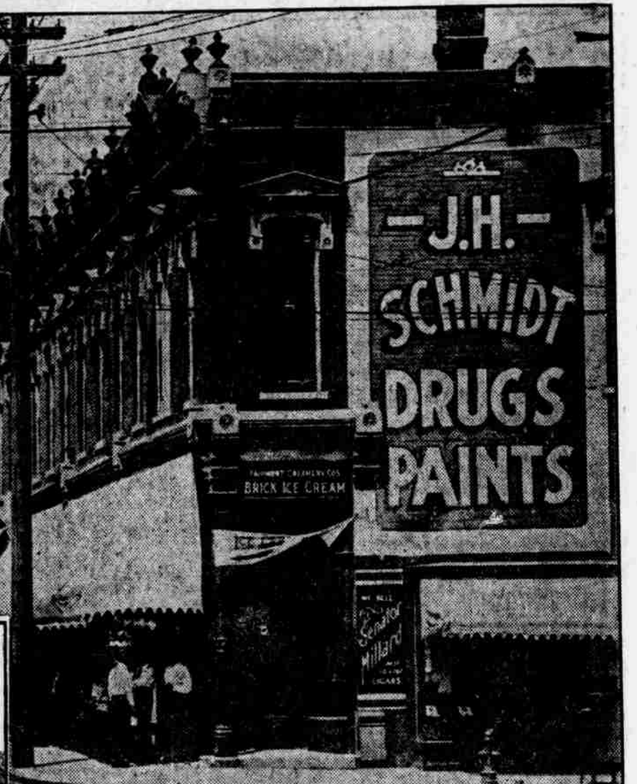
WEST FROM TWENTY-FOURTH STREET.