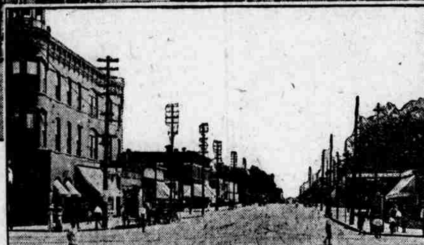
CUMING STREET LOOKING EAST FROM TWENTY-FOURTH.