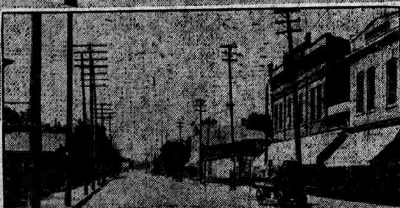
VINTON STREET LOOKING SOUTH FROM EIGHTEENTH ST.