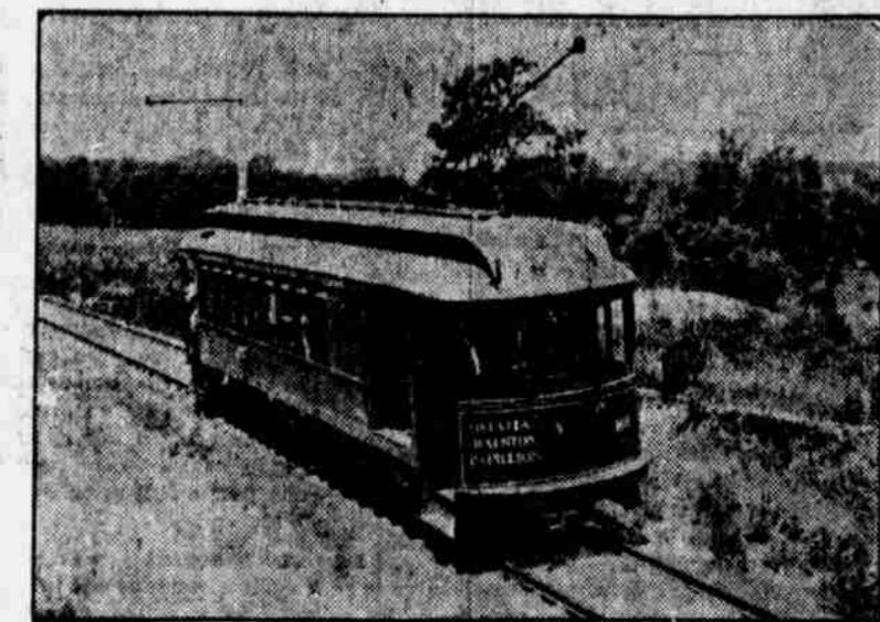
THE LINE TRAVERSES BEAUTIFUL COUNTRY.