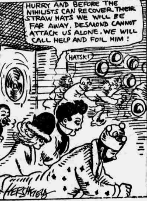
HURRY AND BEFORE THE NIHLISTS CAN RECOVER THEIR STRAW HATS WE WILL BE FAR AWAY. DESMOND CANNOT ATTACK US ALONE. WE WILL CALL HELP AND FOIL HIM!

CZAR, THE VILLAIN DESMOND IS KNOCKING AT THE DOOR. HE AND HIS NIHLIST PALS HAVE STRAW HATS ON. THIS ELECTRIC FAN WILL ROUT THEM, THE POOR NIHLISTS VALUE STRAW HATS, NOW TO OPEN THE DOOR.