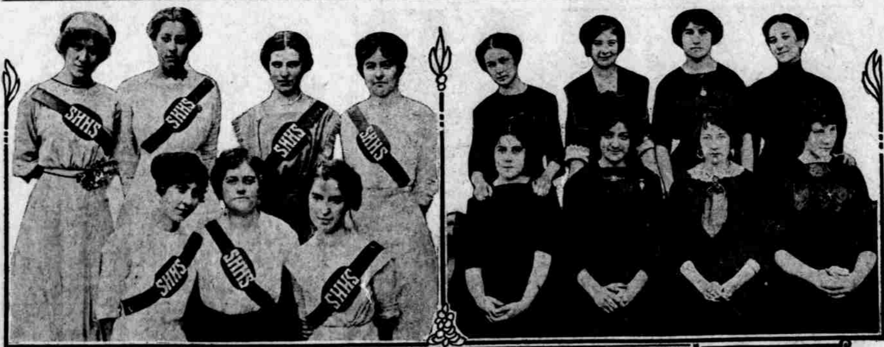
Sacred Heart High School Graduates