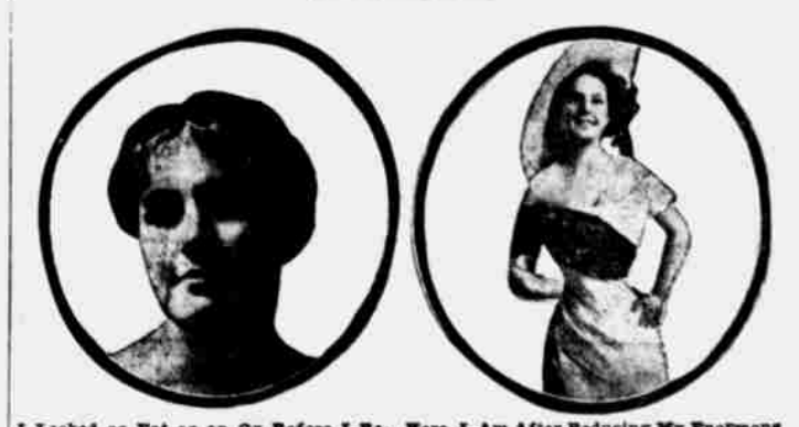
I Looked as Fat as an Ox Before I Reduced My Weight Quickly and Without Harm With My Drugless Fat Reduction Treatment. Here I Am After Reducing My Enormous Weight Quickly and Without Harm With My Drugless Fat Reduction Treatment.

FAT FOLKS DUMFOUNDED THEY STAND AGOGUE IN ADMIRATION AND AMAZEMENT, MARVELING AT THIS WONDEROUS NEW METHOD WHICH HAS FOR AGES RAFFLED THE LEADING EXPERTS OF THE EARTH.