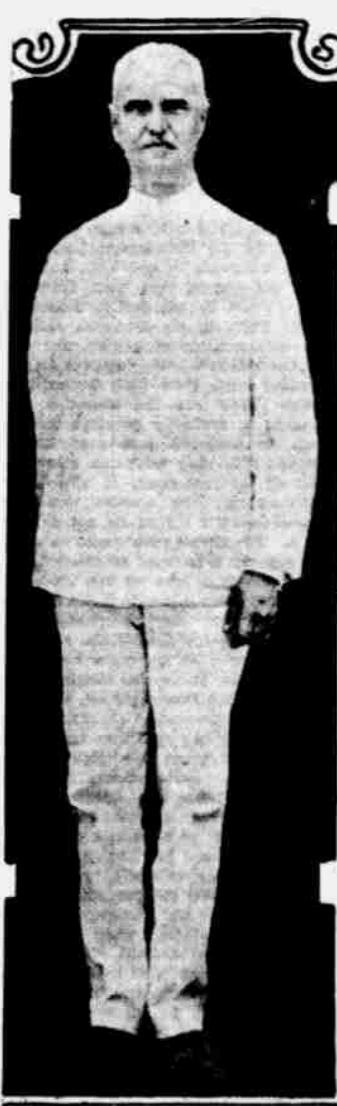
Col. G. W. Goethals

The Slides of the Future. "Tell me something about these slides, colonel. What makes you think they will disappear when the canal is completed?" "We know because we have studied the geological structure of this part of the mountains. We have studied the pressure of the earth, and how the land moves. We have experimented and know that when we have given the slides of the canal prism a natural slope that the earth will be as firm as that of the hills all about us. Such slides are caused by the great weight of earth above and back of the excavation which forces these bodies of earth down into the cut and at the same time presses it upward from the bottom of the canal. By the right slope this great pressure will be removed and when that is done there seems to be no reason