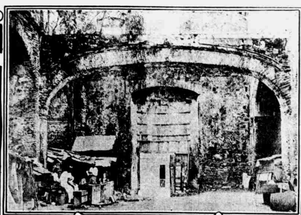
An Arch Two Hundred Years Old

Cost Less Than $375,000,000. "What will be the probable cost of the canal when it is completed?" "That will depend very much on the accessories, such as dry docks, terminals, coaling stations and supply houses. It will certainly be less than $375,000,000. At the present time we are expecting to save from $15,000,000 to $20,000,000 on the estimated cost." "How can you make such calculations as to a job of these mighty dimensions?" "It is very simple," said Colonel Goethals. "We make our measurements and estimate the quantity. Then from the