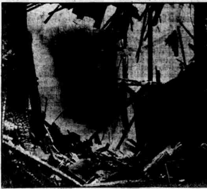
INTERIOR VIEW OF AMES BUILDING.

Scenes at the Two Biggest Fires in Omaha for Many Years