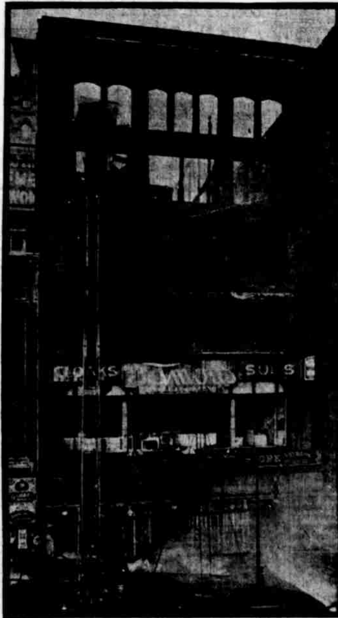
SIXTEENTH STREET FRONT OF AMES BUILDING.