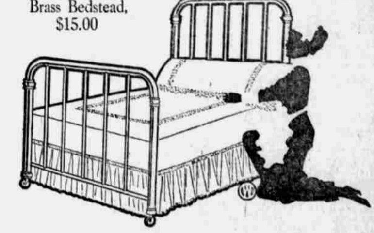
Brass Beds of Merit

Our line of baby vehicles is famous for its quality, originality and superiority. The 1912 models present every excellent variety in makes that are beautiful, serviceable and durable.