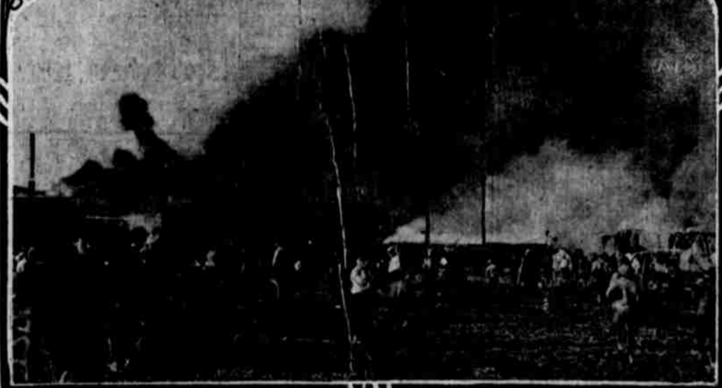
View of Fire from the South