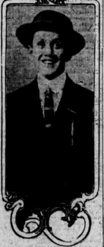
Johnny Kilbane of Cleveland, conqueror of Abe Attell, who outpointed the light weight champion of eleven years in their twenty-round bout at Los Angeles, Cal. Kilbane fought one of the most remarkable battles ever seen in that part of the country and wrested the title from Attell by beating him at the fine points of his own game—boxing, speed and clever judgment.