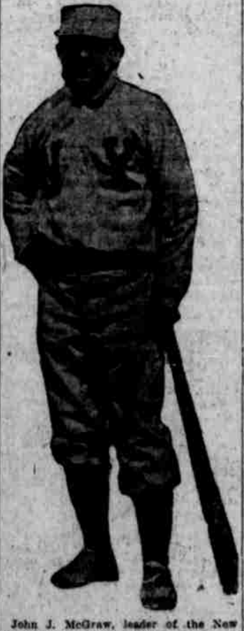
John J. McGraw, leader of the New York Giants, who is working his charges at Marlin Springs, Tex., getting several weeks start over all other big league teams.