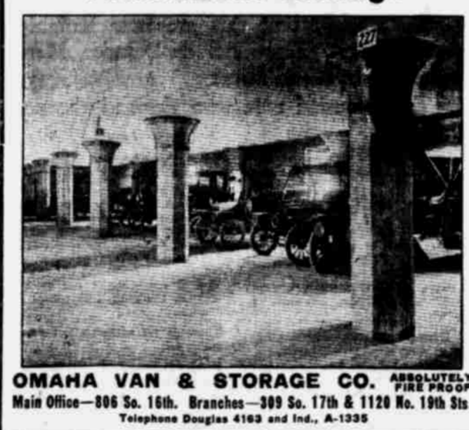
OMAHA VAN & STORAGE CO. ABSOLUTELY FIRE PROOF. Main Office—806 So. 16th. Branches—309 So. 17th & 1120 No. 19th Sts. Telephone Douglas 4163 and Ind., A-1335

Block 243. Do your customers live here? On 25th Street, between Chicago and Cass Streets, there are 6 occupied houses and in 5 they take The Bee. Advertisers can cover Omaha with one newspaper.