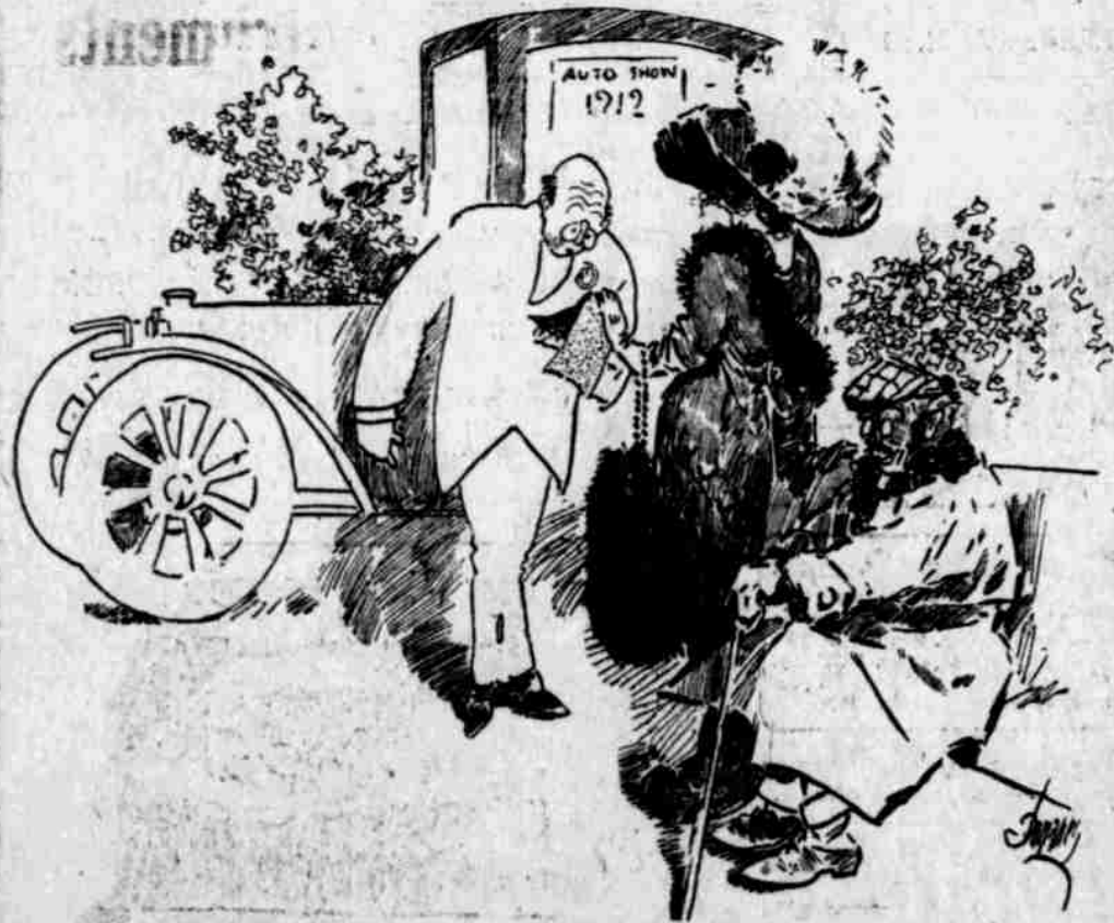
"Now, if you can match this sample in cadet blue or wistaria, trimmed in pomegranate, father says he'll buy out."

LOCAL MANAGER FOR GOODYEAR TIRE AND RUBBER COMPANY.