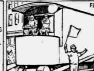
STEAM CALIOPE ATTACHED TO TAXI-CAB. NOT ONLY WARNING THOSE IN ITS PATH BUT ENTERTAINING WITH SWEET MUSIC, ITS PASSENGERS AS WELL AS ADJACENT OFFICE DWELLERS AND RESIDENTS.