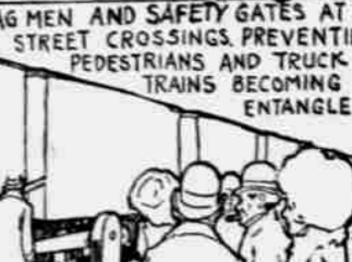
FLAG MEN AND SAFETY GATES AT ALL STREET CROSSINGS. PREVENTING PEDESTRIANS AND TRUCK TRAINS BECOMING ENTANGLED.