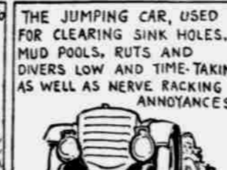
ELIMINATING THE NECESSITY OF CRAWLING UNDER IT.