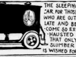
THE PORTABLE JACK. USED TO TURN THE CAR OVER WHEN REPAIRS ARE DEMANDED.