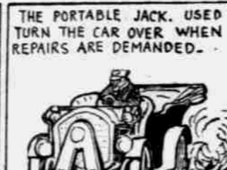
THE JUMPING CAR. USED FOR CLEARING SINK HOLES, MUD POOLS, RUTS AND DIVERS LOW AND TIME-TAKING AS WELL AS NERVE-TAKING ANNOYANCES.