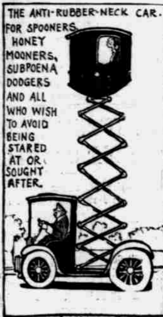
THE ANTI-RUBBER-NECK CAR. FOR SPOONERS, MONEY MOGNERS, SUBPOENA DODGERS AND ALL WHO WISH TO AVOID BEING STARED AT OR SOUGHT AFTER.