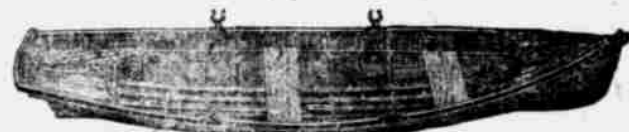
Mullin's Steel Boats Guaranteed

Built like Government Torpedo Boats—of tough, puncture-proof steel plates, pressed to rigid form and so securely joined together that a leak is impossible. Mullin's Steel Boats are GUARANTEED against puncture—leaking—waterlogging—warping—drying out—opening seams—and NEVER REQUIRE CALKING. They are provided with air-tight compartments, like life boats.