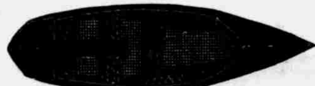
MULLIN STEEL LAUNCHES

Summer now only a short time away—YOU WANT A GOOD BOAT—A SAFE BOAT—SO SEE THE MULLIN'S BOAT AT THIS STORE. We have the kind of boat that you want. The launch or the light boat for use of the family, steel hunting boats, fishing boats, row boats and cedar canvas-covered canoes.