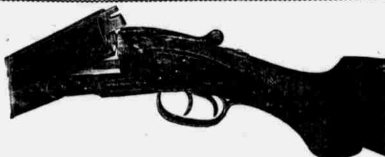
Baker "Batavia Special"

THIS gun is the result of years of experience in the manufacture of high grade shot guns. Today it is recognized as the most efficient, true shotgun on the market.