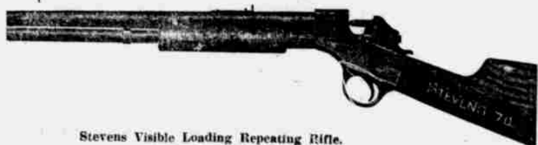
Stevens Visible Loading Repeating Rifle.

The Stevens 522 is the ideal trap gun for both experts and amateurs.