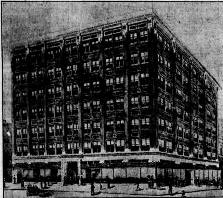
JOHN LATENSER, Architect, 626-32 Bee Building.