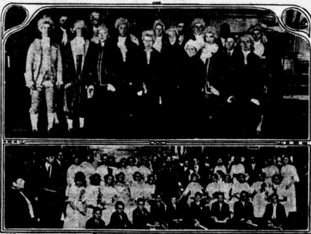
UPPER PANEL—LOTHROP SCHOOL; LOWER PANEL—GRADUATING CLASS AT LOTHROP SCHOOL.