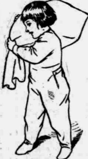
"Arnold" KNIT NIGHTIES PROTECT AGAINST EVERY CHILL