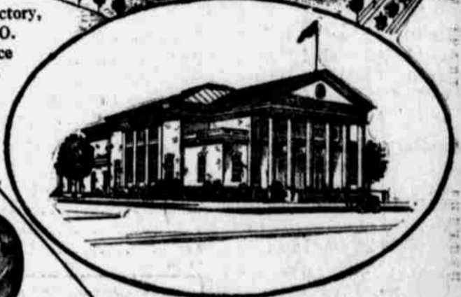
The N. C. R. Hall of Industrial Education, which will be opened by the Hundred Point Club this week.