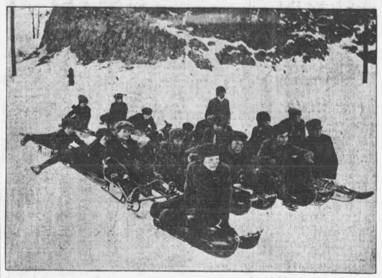
START OF THE RACE DOWN THE PARKER STREET HILL.